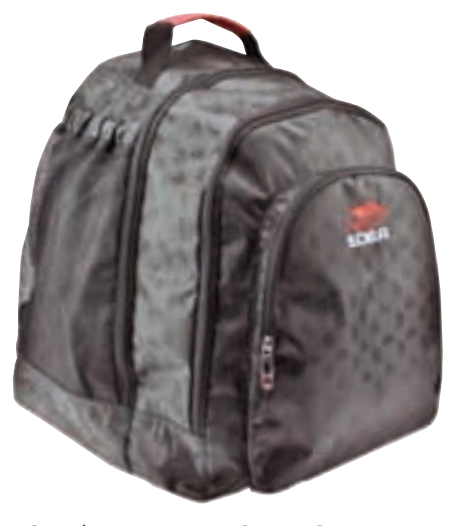
SAC a dos EDEA BACK PACK Nombreuses poches