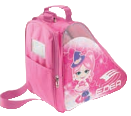
SAC à patins EDEA SOPHIE Pour toutes pointures Rose