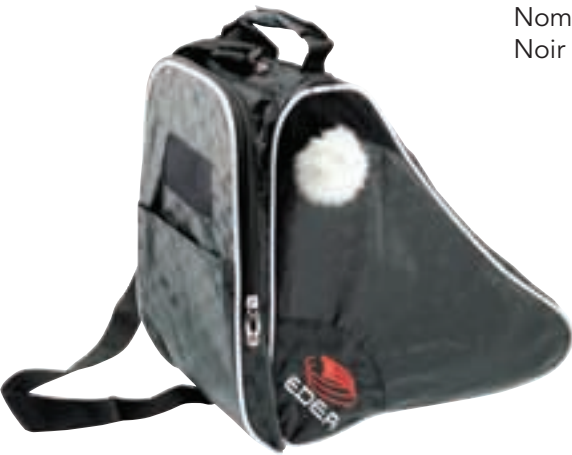
SAC à patins EDEA JACQUARD Pour toutes pointures