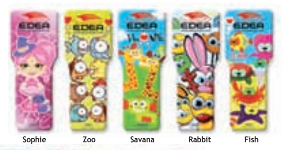
Planche nylon décorée pour apprentissage des gestes hors glace Tous modèles disponibles