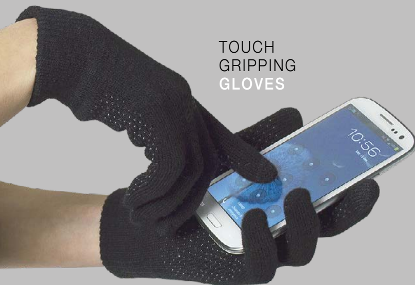
TOUCH GRIPPING GLOVES