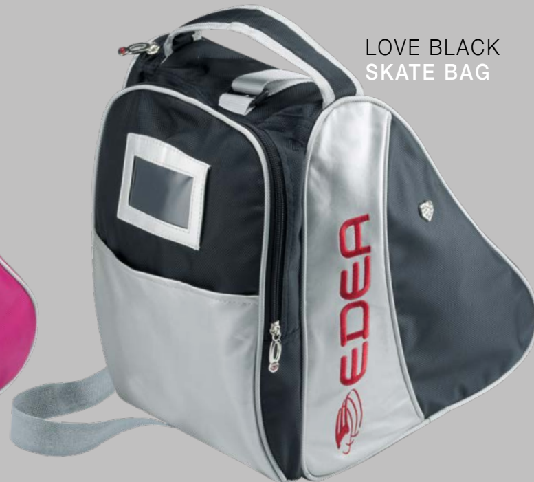
LOVE BLACK SKATE BAG