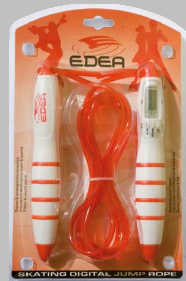
DIGITAL JUMPING ROPE