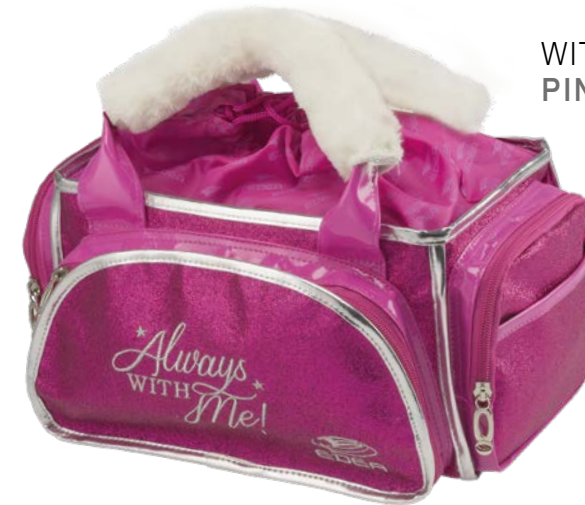
WITH ME PINK