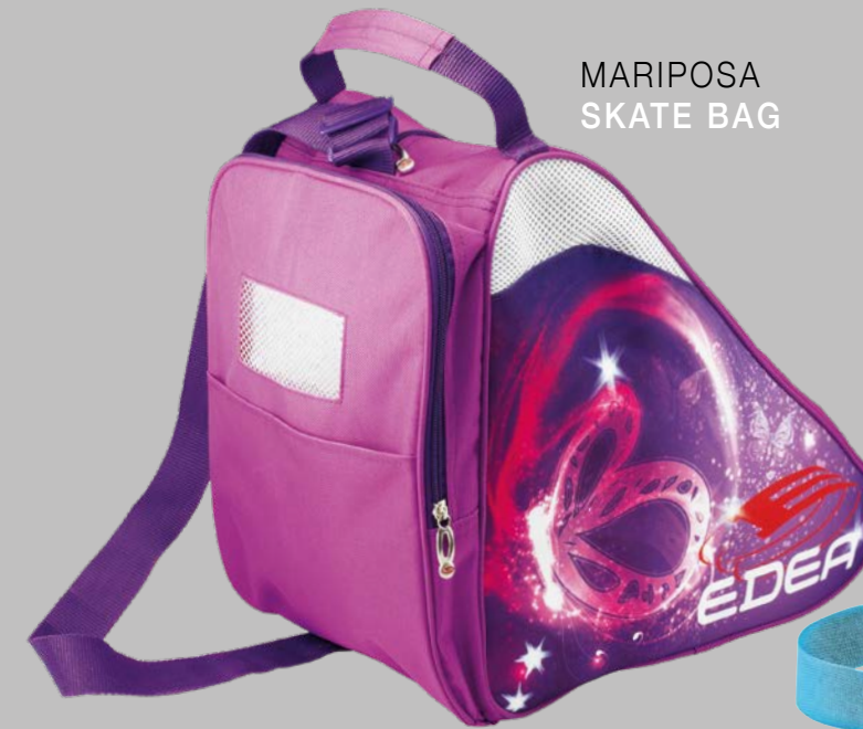
MARIPOSA SKATE BAG