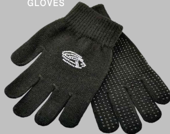
STRASS GRIPPING GLOVES