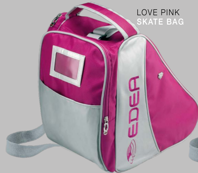
LOVE PINK SKATE BAG