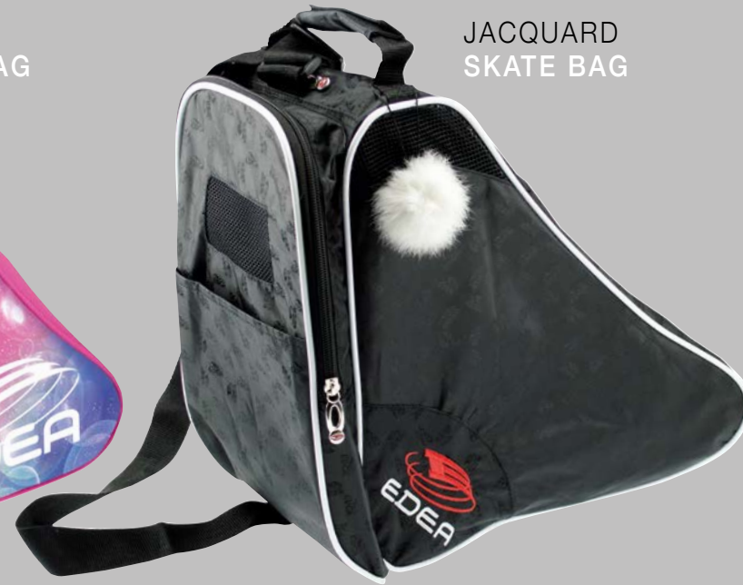
JACQUARD SKATE BAG