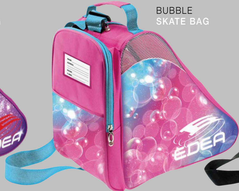
BUBBLE SKATE BAG