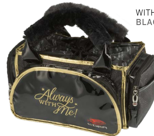
WITH ME BLACK